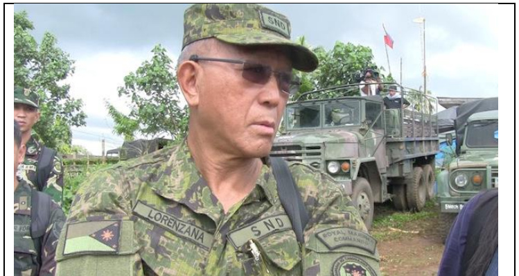
Secretary of National Defense (SND) Delfin Lorenzana wears Hyperstealth's CAMOPAT camouflage uniform November 30, 2016

There is a branch of the Philippine military that has been using our CAMOPAT pattern with our permission and under license since 2016 and that is the PAF branch which is the Headquarters that oversees all the branches.