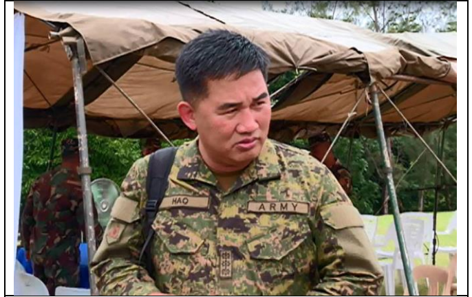
Photo source: ABS-CBN News (Danielle Rabolos) released on 23rd August 2016

We were informed of the specifications of the pattern as it would be released in their tender and they were very different then what I submitted and didn't make sense from a printing perspective for pattern repeats as print rollers are specific sizes and this didn't meet that requirement.