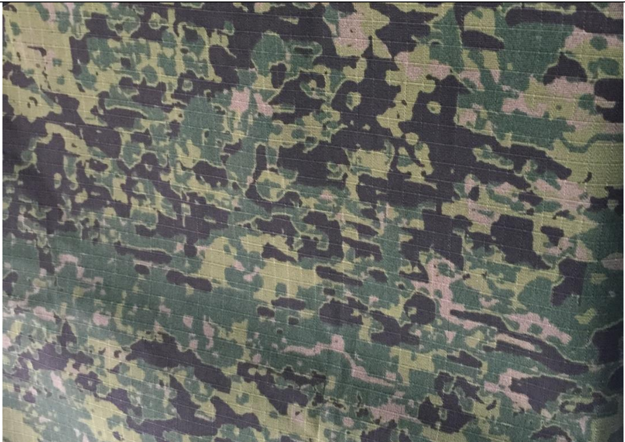
Philippine Army in PHILARPAT Version 3 camouflage

What we were not told was that the Philippine Army had come up with a third version of their PHILARPAT which was modified from CAMOPAT again, this time they removed the Multicam layer they used in Version 2 and moved around different portions of the pattern to try to claim it as an original work.